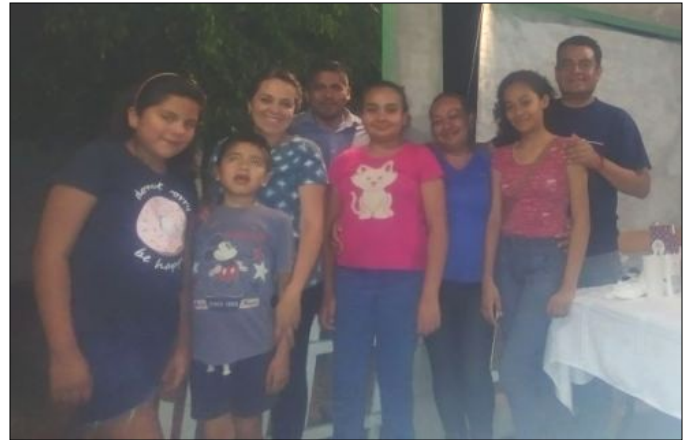
This whole family believed in Jesus on March 9!